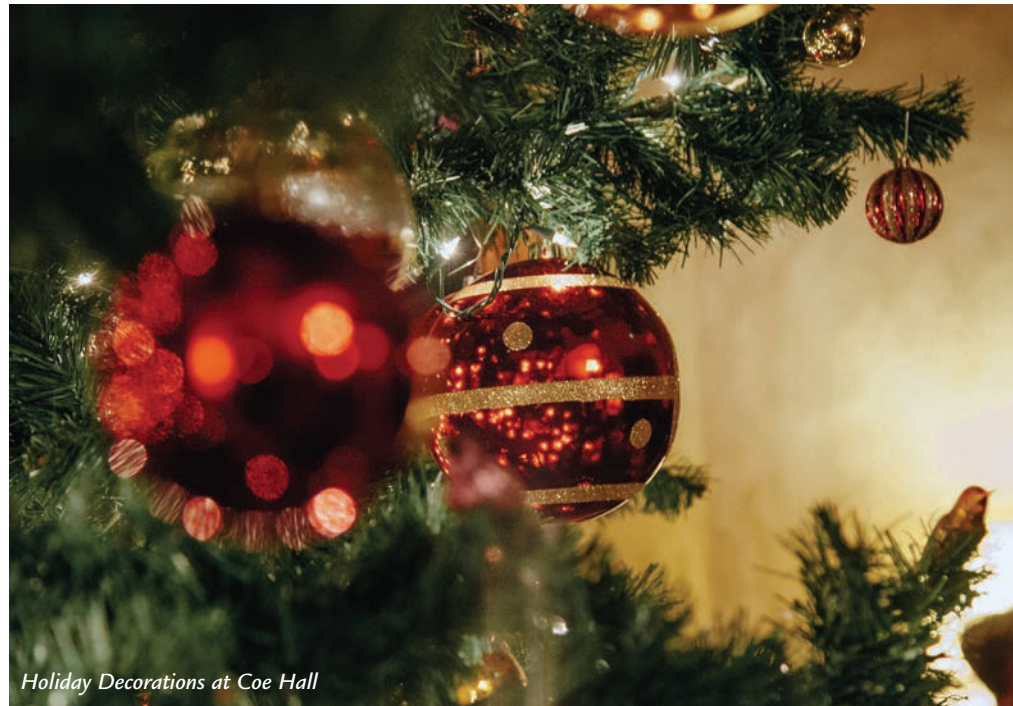
Holiday Decorations at Coe Hall