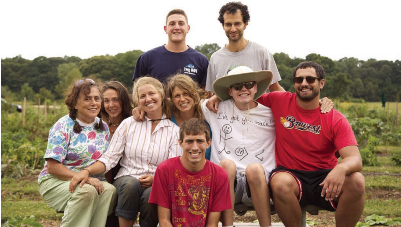
The Sustainability Farm Team