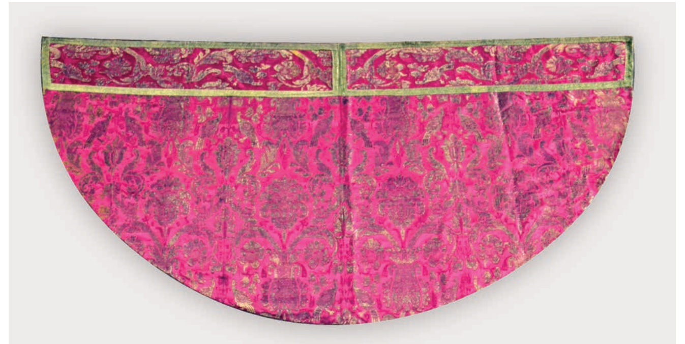
17th century cope acquired for the gallery at Coe Hall

Over the last twelve months one hundred artifacts have been added to Coe Hall, notably a suit of armor on display in the front hall where one once stood. Another fine addition to the house is the reproduction gilded bed along with eight newly made French style chairs for Mai Coe's bedroom. There is also a magnificent Elizabethan style four poster bed for Mr. Coe's bedroom similar to one that appears in Mattie Hewitt's 1920s photographs of the room. Two high quality needlepoint chairs have been added to the gallery, as well as an extremely fine bishop's cope in crimson and gold brocade, probably from the 17th century. Hewitt's photographs of Coe Hall in the 1920s show a similar style cope originally in the room. These are just some of the many artifacts that have been purchased or donated as part of our centennial celebrations at Planting Fields.