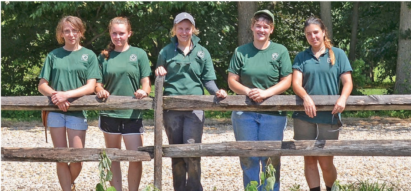
A group of summer interns at Planting Fields

We are so thankful to the Planting Fields Foundation and the Board of Trustees for continually supporting this program. The interns have become an important part of the arboretum staff working side by side with permanent employees on many worthy projects. This program is such a vital part of the care and maintenance of the 409 acres that Planting Fields has to offer. We are thankful to have them!