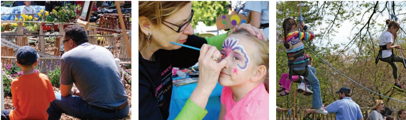
Arbor Day Family Festival