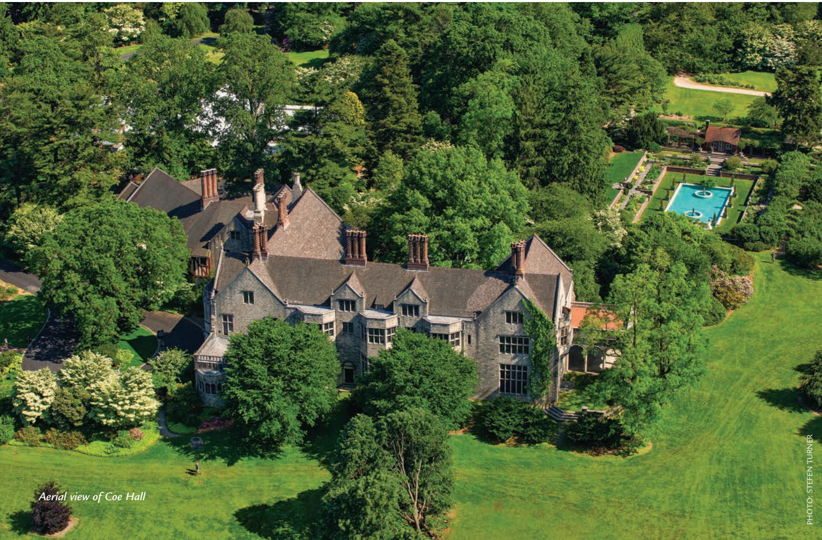
Aerial view of Coe Hall