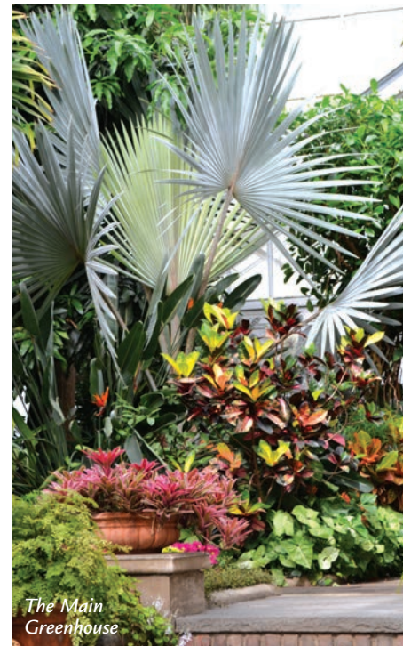
The Main Greenhouse