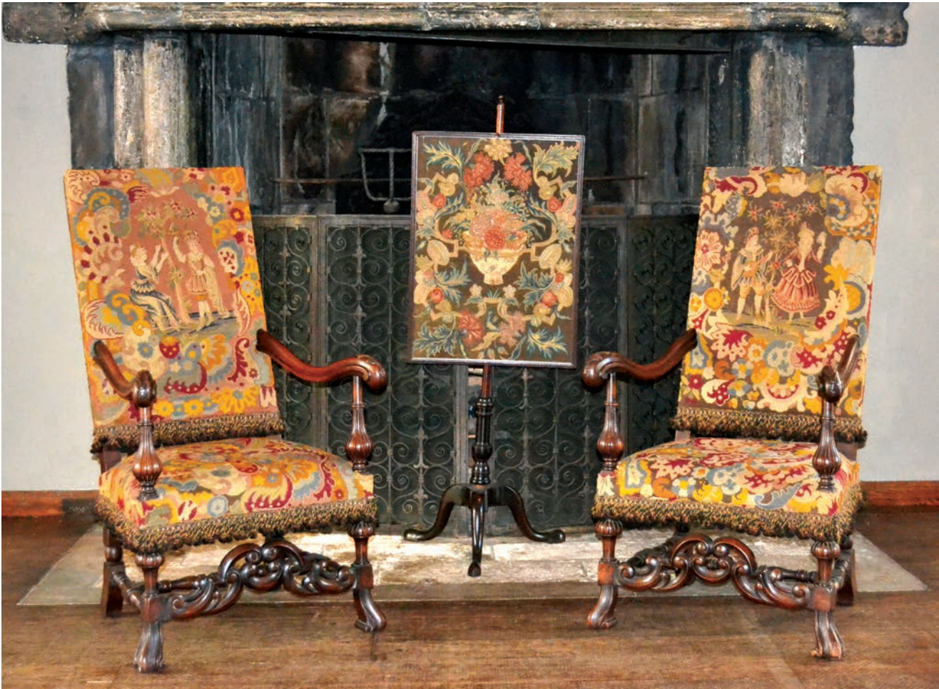
Two baroque style arm chairs and a needle work firescreen recently acquired for the great hall.