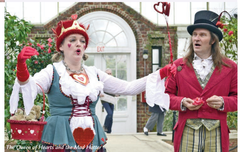
The Queen of Hearts and the Mad Hatter