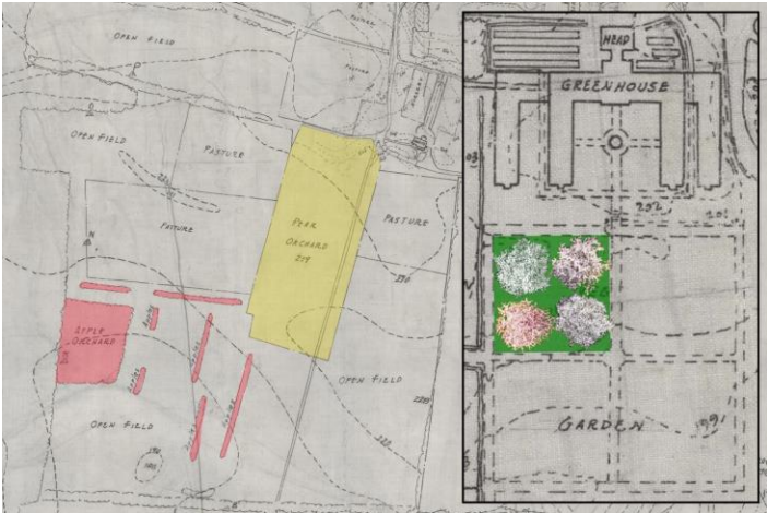
Olmstead Associates, 1935 Topographical Map with apple and pear orchards highlighted and inset of greenhouse magnification with proposed Planting Fields Stand .