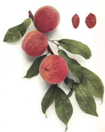
Indian Blood Cling Peach, descendent of variety grown by Matinecock in Oyster Bay