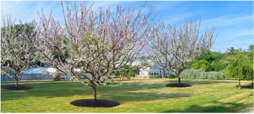
Artist Rendering: The Planting Fields Stand , spring, 2024