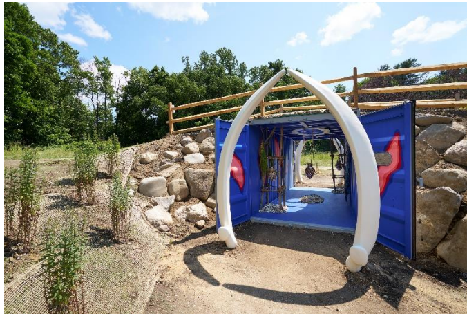
Exterior of Leonard's Planting Fields installment of BREACH: LOGBOOK 23 .